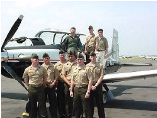
The students learn to fly in both programs. The two